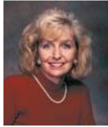
Ruth Ann Davis Williams Furnace